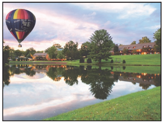
Virginia AGD Colonial Conference to be held at The Boar's Head Inn Charlottesville, VA

if you were to die tomorrow. Learn as if you were to live forever." The Virginia AGD is passionate about lifelong learning and providing outstanding continuing education to our members. That's why, this fall we are proud to announce the beginning of our very own MasterTrack program, on October 4th-6th in Reston, VA.