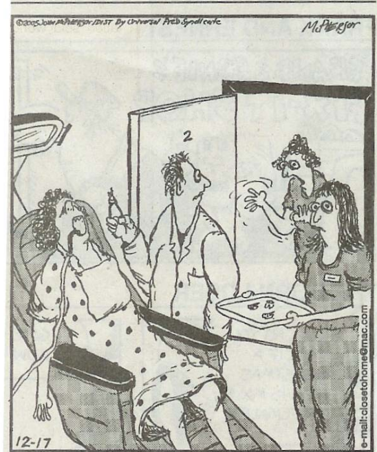
"Dr. Hamer! WAIT! That's Mrs. TILLman, here for a cleaning! Mrs. HILLman is the one having eight teeth extracted!"